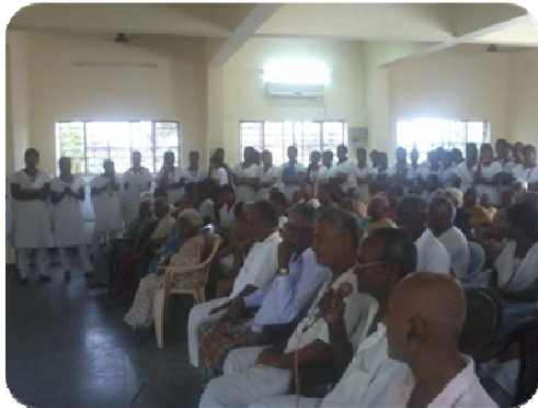
Annaithersa nursing college student visit to TEV the interacted with the Elders