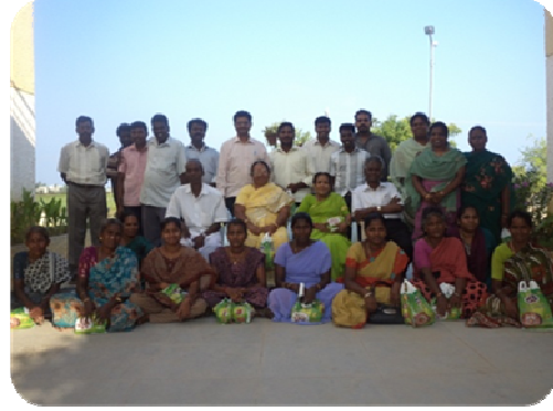
Helpage India Staff received the Deepwali sweets