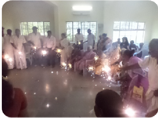
TEV Elder Celebrates Deepwali festival