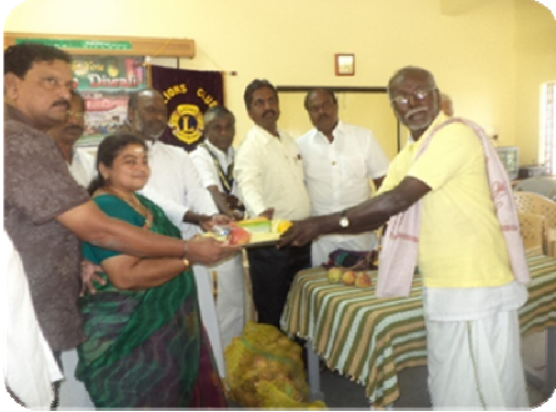
Cuddalore Lines Club Donating dress material to the Elders