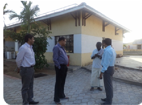
Le Hotel MD visited TEV.