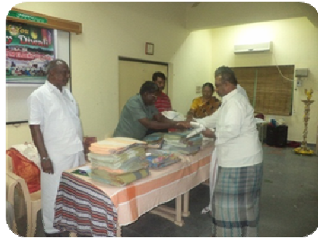
TNEB Superintendent and Periyagannakuppam President, donate dress material.